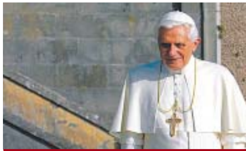
A DELICATE MOMENT IN TURKEY 8 All eyes on Pope's visit