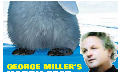
GEORGE MILLER'S HAPPY FEAT PAGE 34