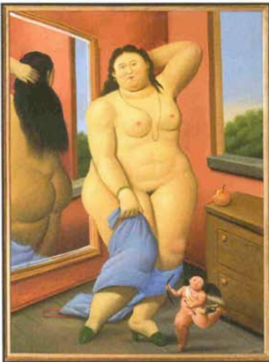
RIGHT: FERNANDO BOTERO, VENUS